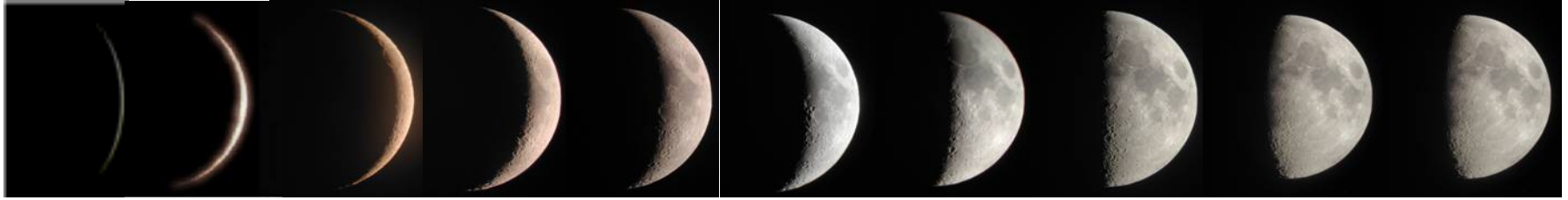
Hilo Hoaka Kūkahi Kūlua Kūkolu Kūpau ‘Olekūkahi ‘Olekūlua ‘Olekūkolu ‘Olepau