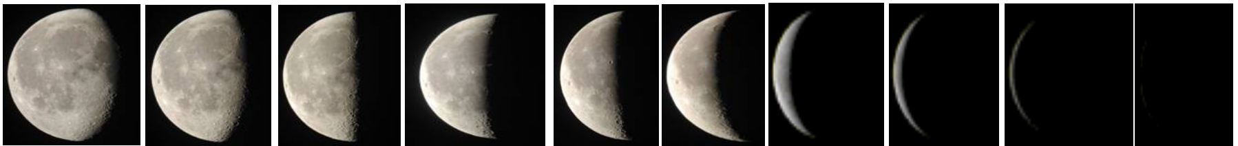
‘Olekūkahi ‘Olekūlua ‘Olepau Kāloakūkahi Kāloakūlua Kāloapau Kāne Lono Maui Muku