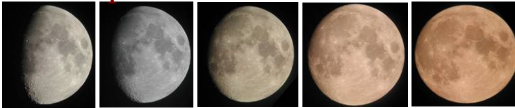
Huna Mohalu Hua Akua Hoku